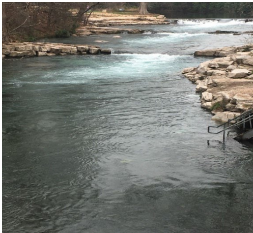
San Marcos River near the office

We have made changes to our Board and would like to welcome all members into the DRC!